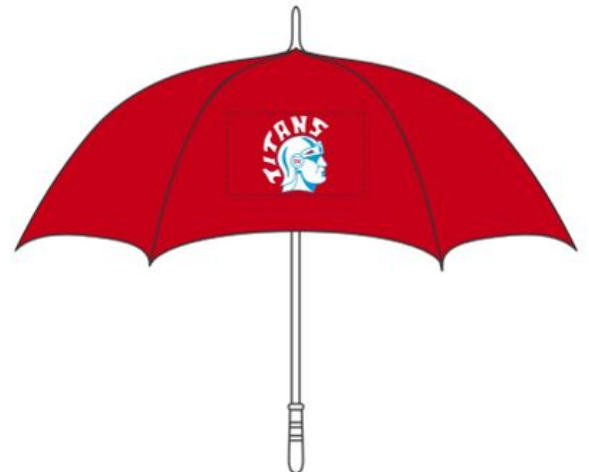
Golf Umbrellas 60" arc