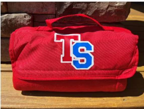
Fleece Blankets 55" x 45"