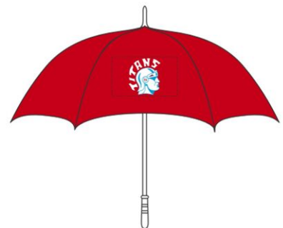
Golf Umbrellas 60" arc

The Band Boosters have red TS blankets and red Titan umbrellas for sale. They will be for sale in the upper concession stand at the home football games,